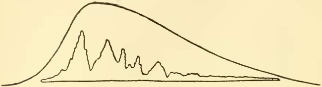
Section across New Zealand, in the latitude of Mt. Cook.

movement is renewed or continued, as seems probable, then it may be the fate of the site of Sydney to sink under the sea.